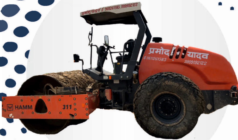
SOIL COMPACTOR 10