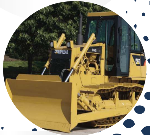
2 - DOZER D-6G2