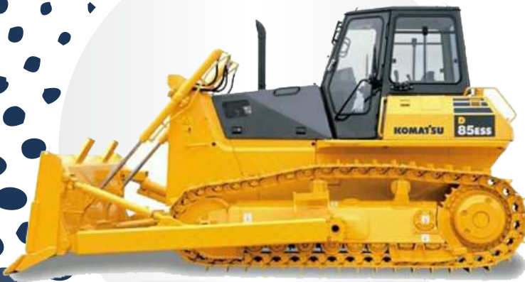
1 - DOZER D-85